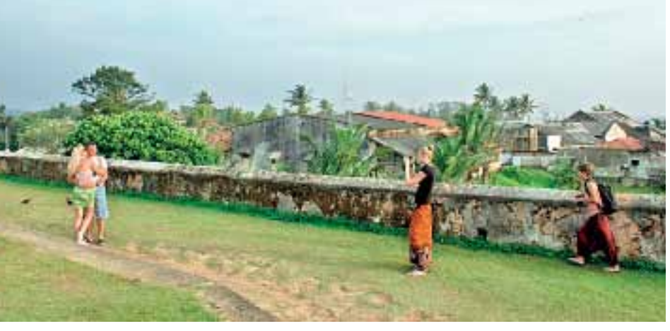
The models and the shutterbugs

Till then, the stony walls will continue to write their story along with that of the men, birds and animals who visit it