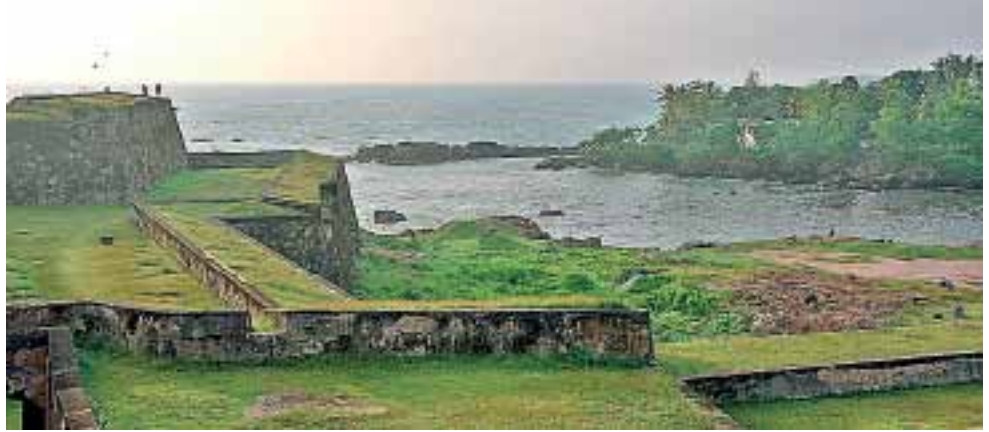
At the edge of the world