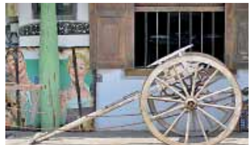
Smiling through time - Antiques on display