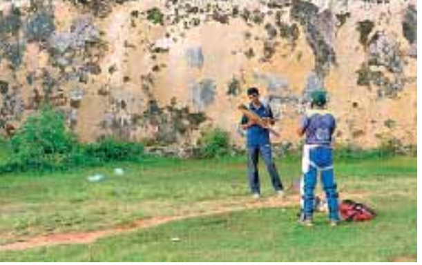
Cricket inside the fort