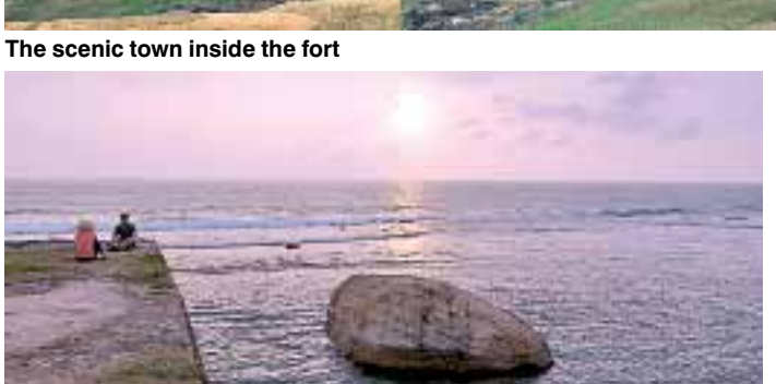
The end of another day