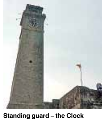
Tower, dated 1707 and cast in 1709, which rang every hour