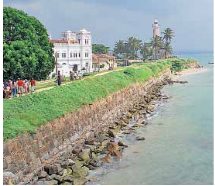
Quintessentially Galle - the Lighthouse, built by the British in 1796 on the Utrecht Bastion and the Meera Mosque built in 1904