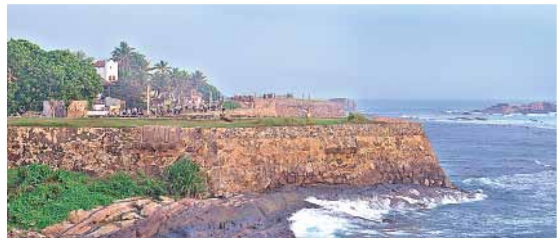
Waves lashing against the age-old bastion