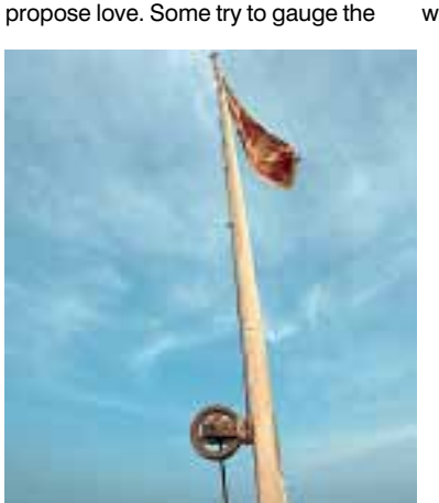
Fluttering in pride