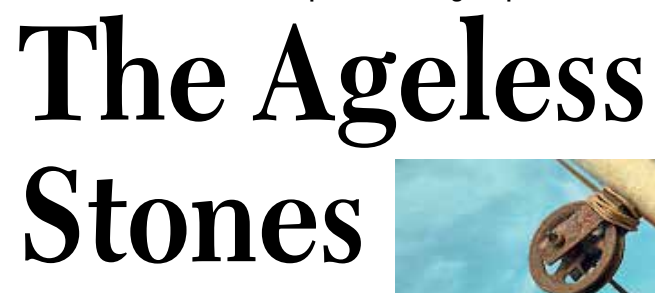
PIX AND TEXT BY SRAVASTI GHOSH DASTIDAR