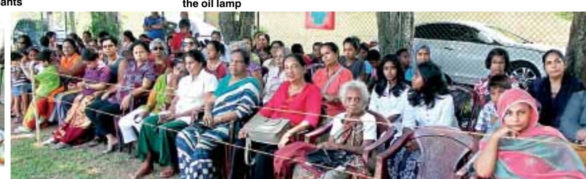
A section of the crowd