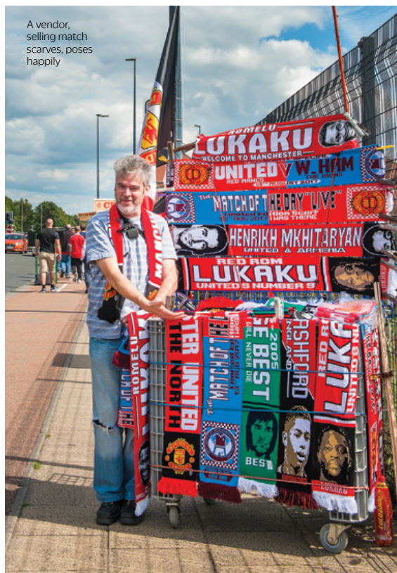
A vendor, selling match scarves, poses happily

fensive' flags 'without sticks or poles' and banners. MU fans transcending age, gender, religion and nationality sing their club chants, like Ole Ole Ander Herrea . They snack at the fish and chips or burger and hotdog kiosks in and around Old Trafford. The foot-long hotdogs with onion and English mustard are to-die-for. Kiosks and vendors selling club souvenirs and match scarves colour the way.