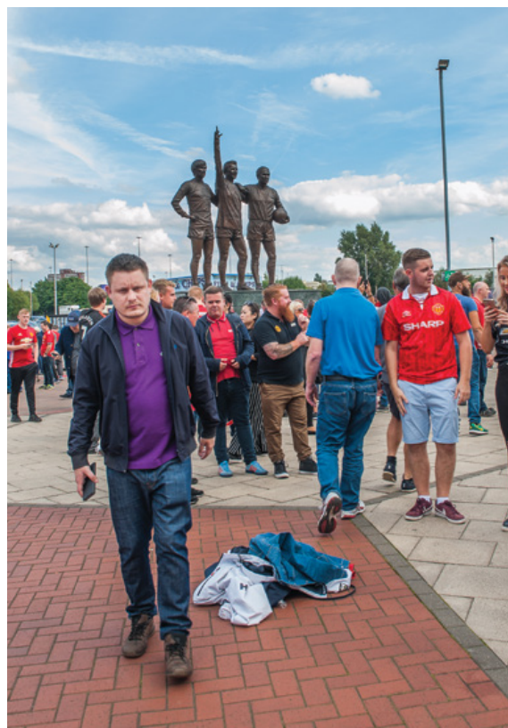
The most photographed statue at Old Trafford