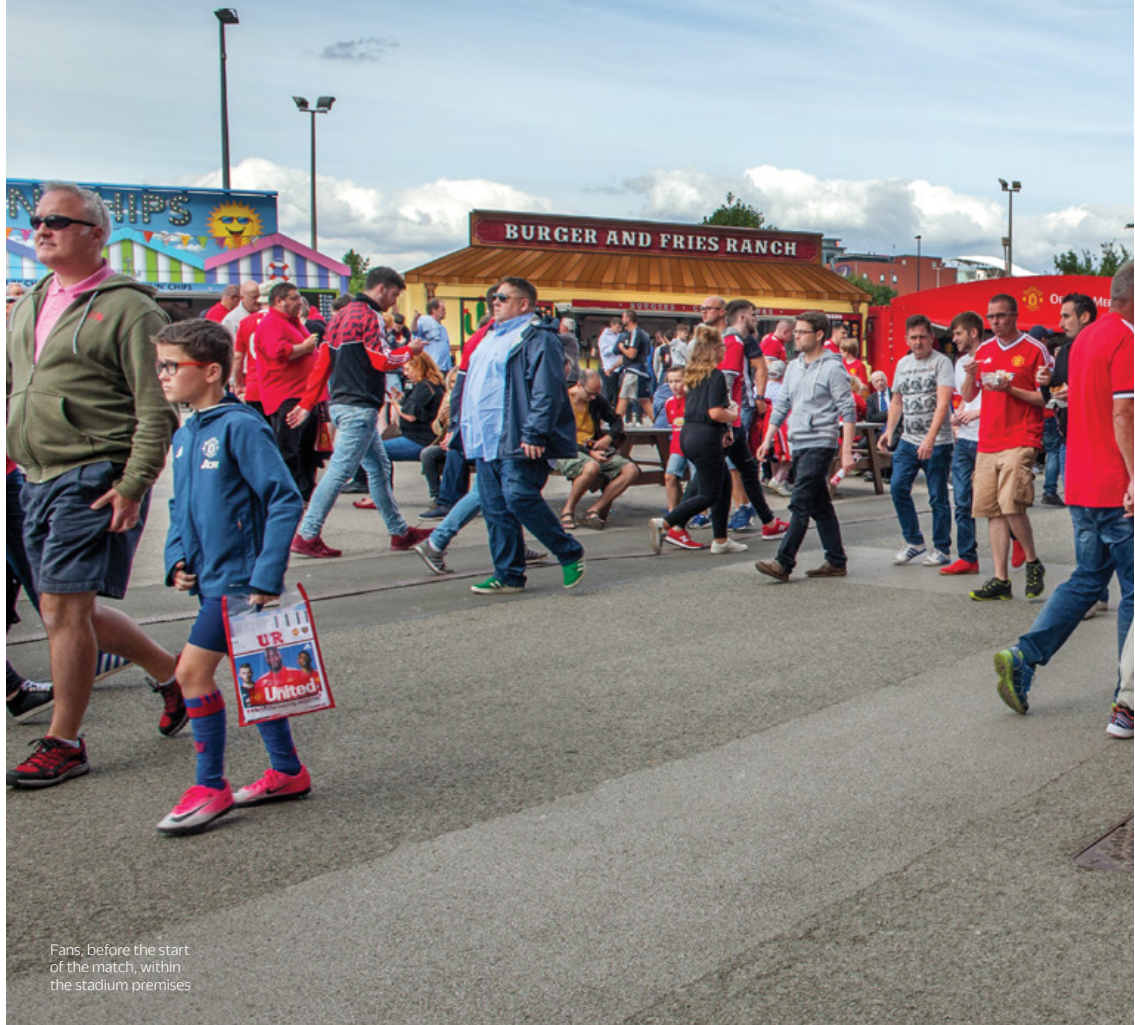
Fans, before the start of the match, within the stadium premises