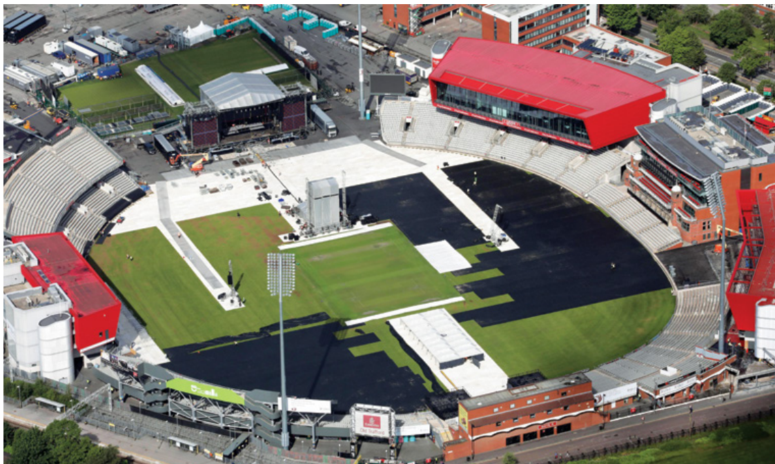
An aerial view of Old Trafford cricket ground in Manchester

A desperate fan with his pants falling off is running away from the tickets and membership services building, with the Manchester United Yearbook in hand. The stadium police and stewards unite to chase the man.