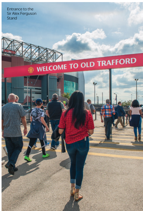
Entrance to the Sir Alex Ferguson Stand