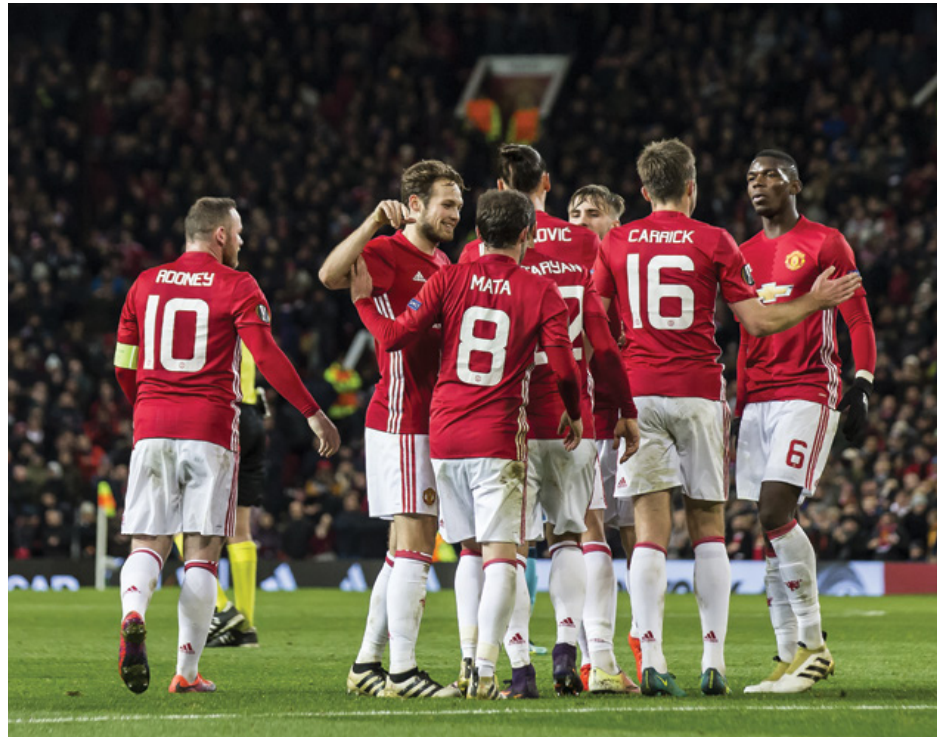
24 November 2016: Manchester United celebrating Wayne Rooney, Daley Blind, Juan Mata, Zlatan Ibrahimovic, Michael Carrick and Paul Pogba

titles. Excited fans in club colours make their way to the 107-year-old stadium after downing pints at local pubs like The Trafford and Toll Gate. Some wish there were cheaper bars beneath the stands, unlike the flagship Red Café, so they can reach the venue early to build the atmosphere. Home fans travel from near and far in cars, trains, trams or buses. Away fans come in coaches organised by the away club. There are parking lots in and around the stadium, which charge £3-10 depending on the distance from the ground. The stadium has its own train station just outside the away end. The quickest is the tram or the metrolink to the nearest tram station that is a 10-minute walk from the stadium's Sir Matt Busby Way. Once the epitome of fan culture, the violence and hooliganism associated with English Football in the past has seen a big change by steps taken by the FA over time. The Red Devils nevertheless march on, waving their 'non-of-